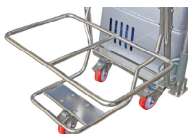
S/S Dual holder for tank with wheel Code 33112/2R