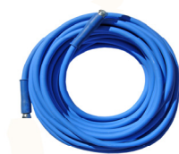
H.P. hose R/2 L= 20 mt. Crimped 3/8" zinc. female Code 18220