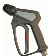
H.p. gun with coupling Ø 14 Code 25095/ST