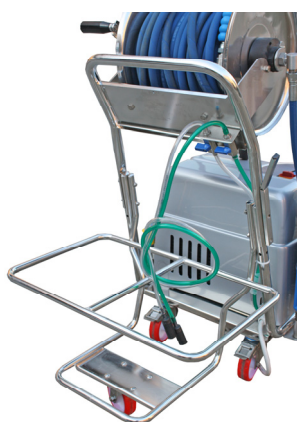
Kit Double Suction S/S Dual holder for tank with N. 02 Ball Valves for dosing detergents Code K80